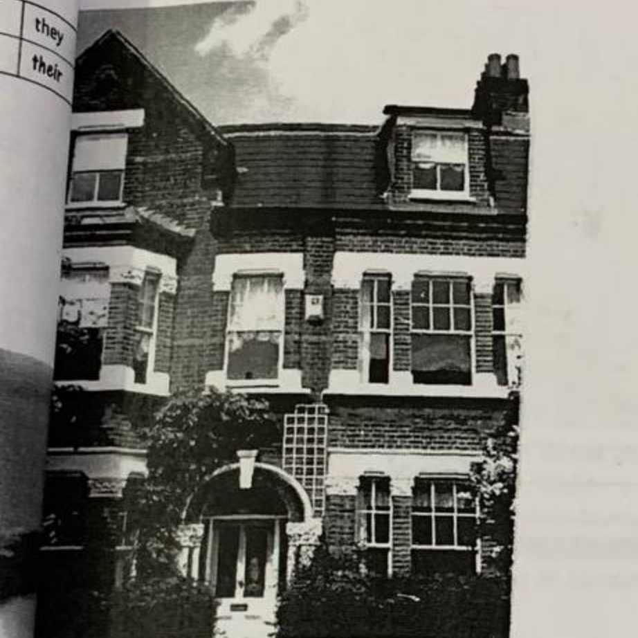
This is our house